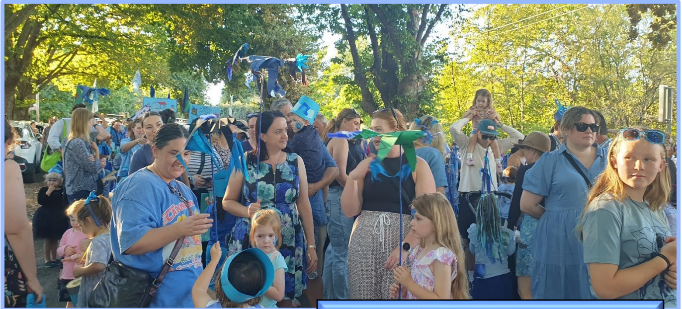
MARCHING TO THE BLUES BEAT